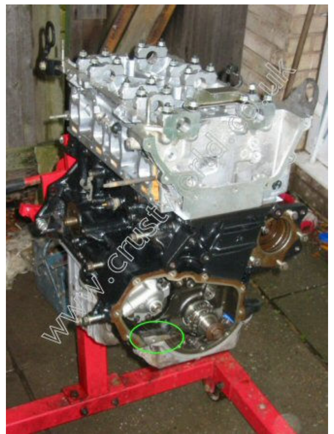
The 8-valve cylinder head in place on the 2.3 short block. Note the fillet piece to block the hole left in the block by the drive chain for the balancer shafts (circled)

Because the cylinder head interface design is identical across all 2.0 8-valve and 2.0 / 1.3 16-valve engine designs, there are no issues to bear in mind when fitting the cylinder head beyond ensuring the correct gasket is used for the cylinder block and the surfaces are spotlessly clean.