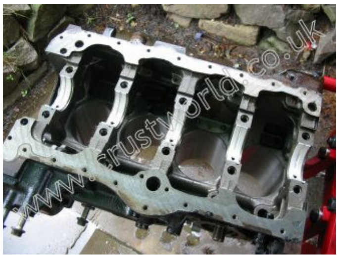
The new upper main bearing shells are inserted into the cleaned and prepared engine block.

In building my 2.3 8-valve engine, I chose to fit new bigend and main bearings as the history of the engine was unknown – despite the bearing shells appearing not excessively worn or otherwise damaged.