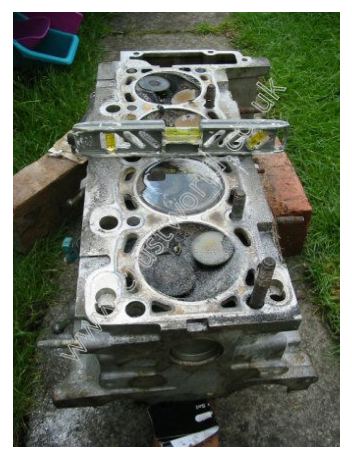
(above) with the head up-side-down and carefully levelled, the combustion chamber is slowly filled with water to determine its volume. Usually the combustion chamber will be sealed with a Perspex sheet acting as a "head gasket" so the volume can be accurately determined without surface tension or fluid spills giving false readings.

By machining away the material opposite the spark plug, I discovered I could safely remove the required 2cm<sup>3</sup> of material to bring the compression ratio down to 10.5 : 1 without affecting the strength of the casting – test holes drilled subsequently revealed the aluminium alloy is surprisingly thick at this point.