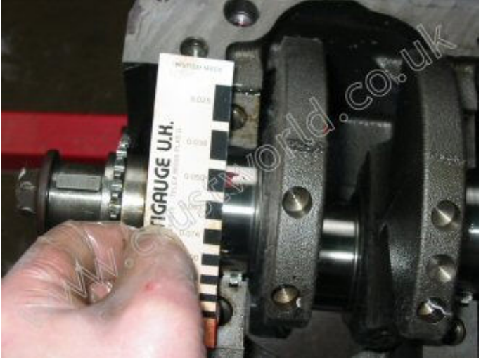
The running clearance of number 1 main bearing is checked using "plastigauge". The width of the compressed element is compared against the card scale, showing the bearing is "in tolerance"

It is important to have bearing clearances that are in specification. Incorrect clearances could lead to overheating and binding problems if the bearing is too tight and low oil pressure and excessive noise when running if too loose.