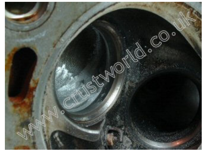
Showing the early stages of polishing the walls of one of the inlet tracts