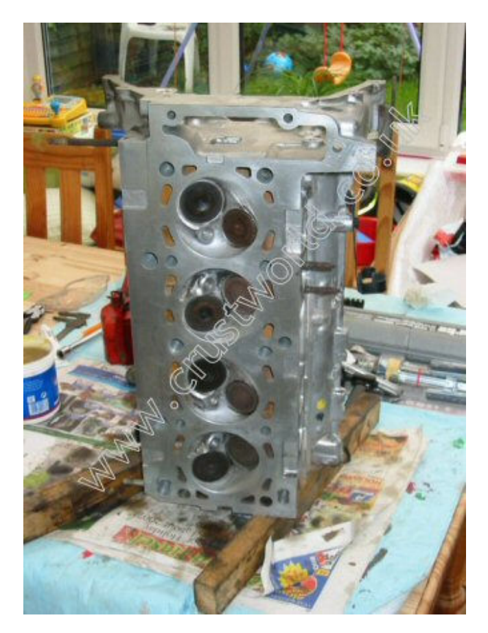
NOTE: If a cylinder head is used that has been previously machined ("refaced") to restore the head gasket surface to true, additional material may need removing from the combustion chamber to ensure the desired compression ratio is reached. In these circumstances, it is highly recommended that a decompression plate is used to obtain the correct compression ratio as removing too much material from the cylinder head will weaken it.

Grinding completed, the final stage in cylinder head modification was to clean the head to eliminate traces of swarf, ensure the head gasket face was clean and lap and refit the valves with fresh valve stem oil seals.