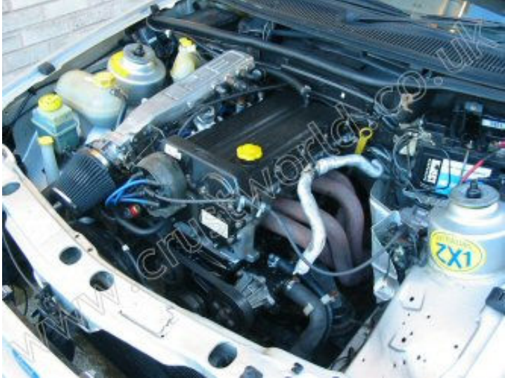
Like it was meant to be there and little to visually distinguish it from a standard 2.0 DOHC – the 2.3 8-valve DOHC hybrid