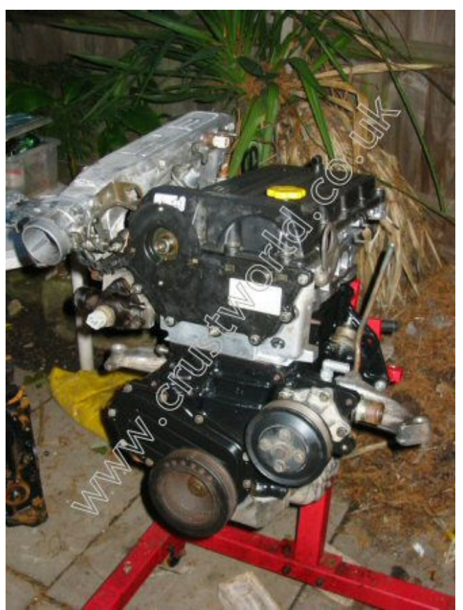
Complete and ready for installation – all covers, inlet manifold, injectors and fuel rail and water pump fitted.

A quick "word" about fuel injectors: 16-valve DOHC "I4" engine variants all use the same fuel injector, a Bosch unit rated at 205cc/min when running fuel pressure of 3bar.