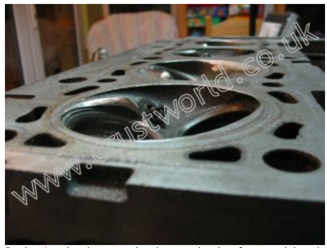
Combustion chambers completed – note the chamfer around the edge of the combustion chamber to give a better "squish band" and prevent the production of hotspots around the edge of the head, and the modified swirl wall next to the inlet valve and spark plug.

...and based on the experiments with the scrap cylinder head, the combustion chambers were ground out and sized as evenly and closely to 50 \text{ cm}^3 as possible.