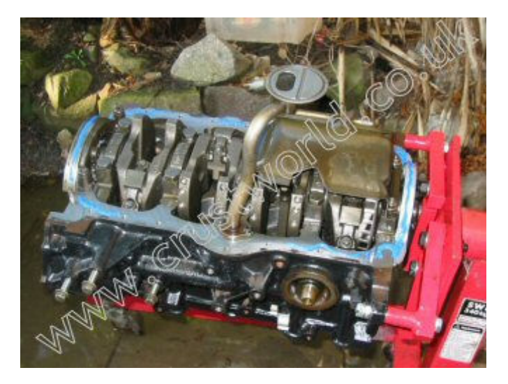
A light smear of gasket cement is applied to the underside of the cylinder block to help the sump gasket seal (above)

Having checked the bearings and fitted the oil splash shield, pickup pipe and sump mounting plate onto the block, the next stage is to fit the 8-valve Sierra oil sump.