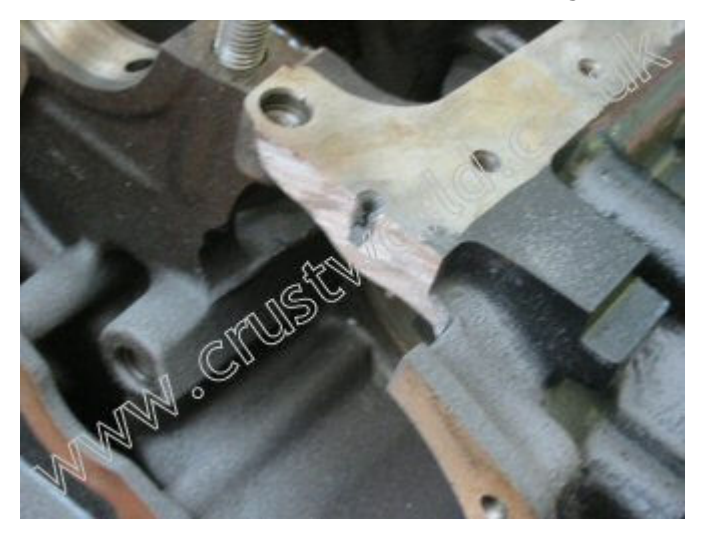
Above, the section removed from the 2.0 block and below, sealed into position on the completed engine.

While this is not the preferred method of creating a fillet to replace the machined-out section of the 2.3 block, it has been surprisingly acceptable so far with no leaks. It is held firmly in position by one of the front lower timing cover bolts, and the adhesive action of the flange sealer.