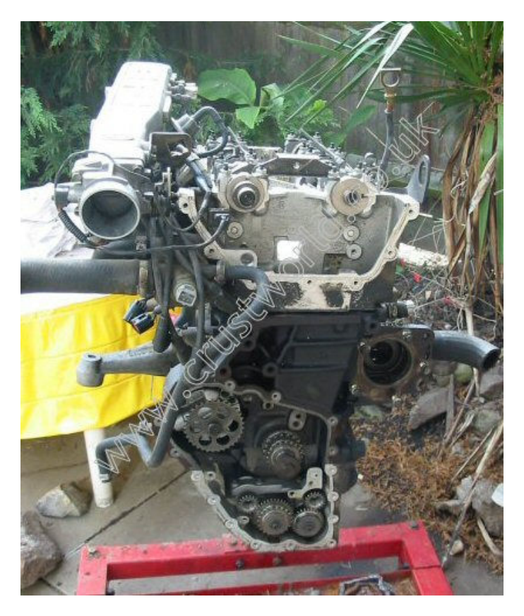
Note that the 2.3 balancer shaft assembly and sump is still attached in this picture.

The picture below shows a "mock up" of the engine, created before the start of the build process.