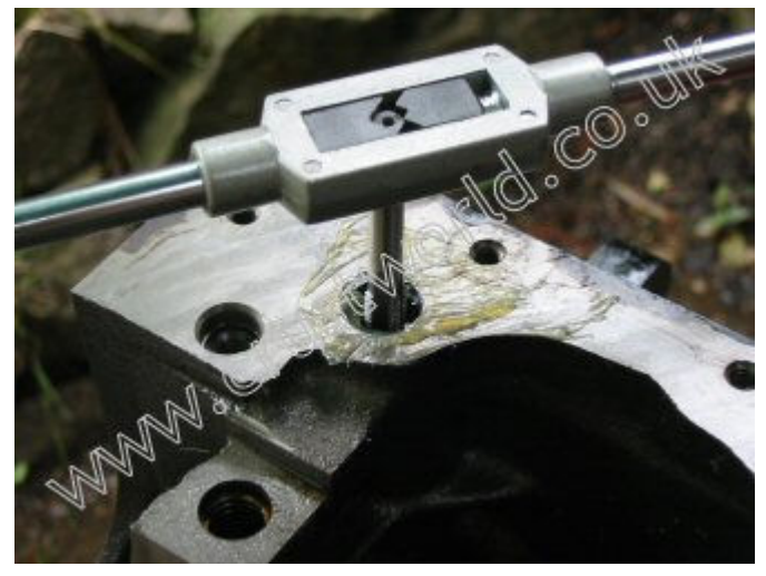
NOTE: Other tap sizes may fit the hole equally well – I discovered that the thread size was identical to that used on DOHC exhaust manifold studs and, having a few old ones "knocking about" in my toolbox, I fashioned a blanking plug from a cut-down exhaust manifold stud.

Using grease packed in the feed hole to catch swarf, a thread is cut using an M8 x 1.25 tap.