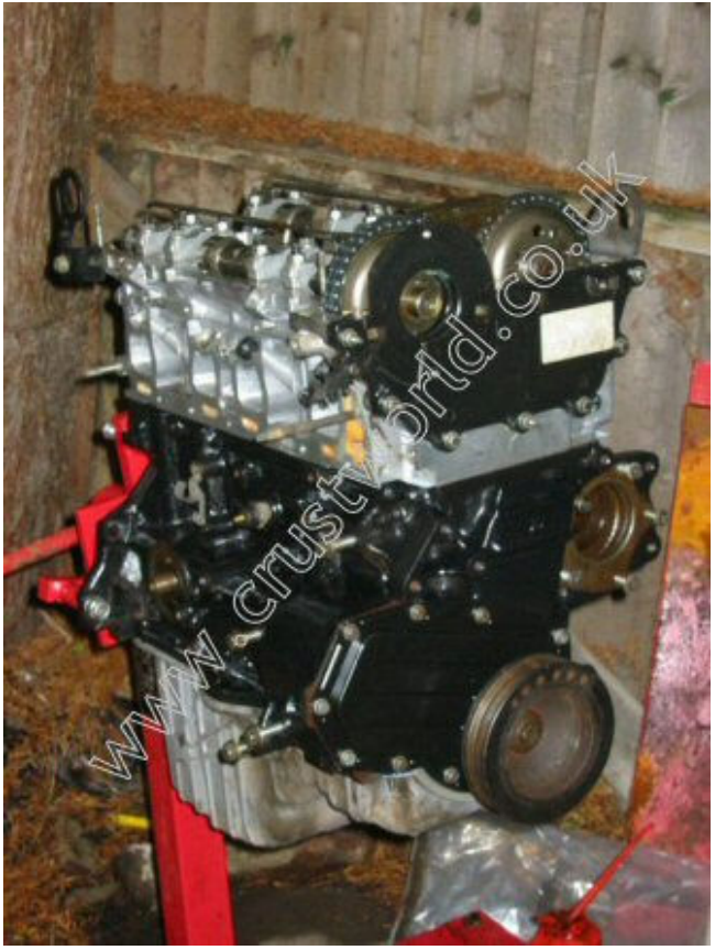
Nearing completion, camshafts and timing chain assemblies refitted