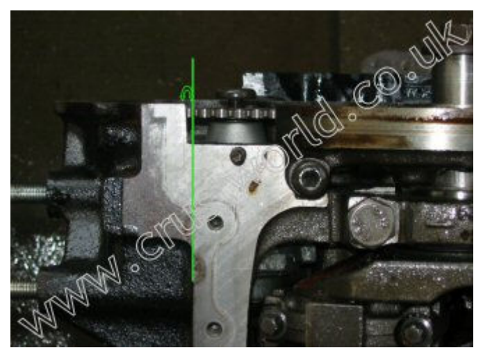
By taking a hacksaw to the 2.0 block and grinding the resultant off-cut carefully with a bench grinder, a filler

It seems that the bulk of the fillet could be cut from the 2.0 block and transferred across – though an alternative solution would have to be found for filling the gap to the left of the green line highlighted on the 2.3 block, below.